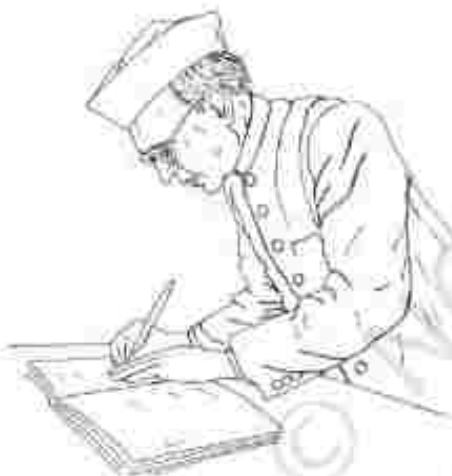
Jawaharlal Nehru CAD, Vol. VI, p. 734

We have already seen that President is the formal head of the government. In this formal sense, the President has wide ranging executive, legislative, judicial and emergency powers. In a parliamentary system, these powers are in reality used by the President only on the advice of the Council of Ministers. The Prime Minister and the Council of Ministers have support of the majority in the Lok Sabha and they are the real executive. In most of the cases, the President has to follow the advice of the Council of Ministers.